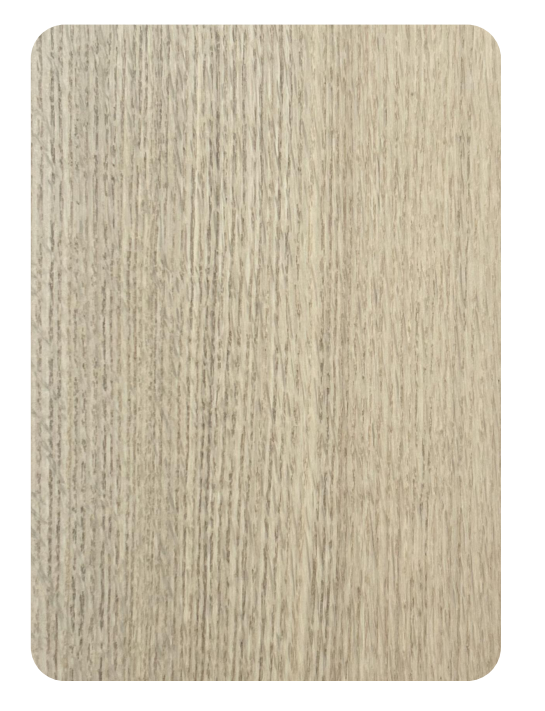
Select Rift & Quartered